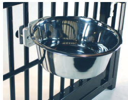
Kennel Bar Mount Together