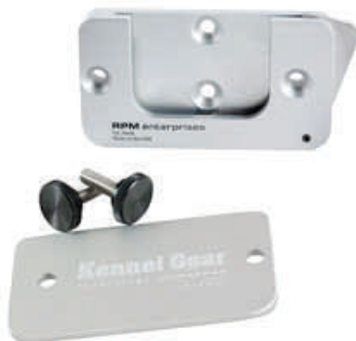
Kennel Bar Mount Separate

**The Kennel Bar Mount is our most universal mounting option. The Kennel Bar Mount attaches to kennels, crates, and (or) solid surfaces (attaching to solid surfaces does not require the back plate or thumbscrews). The Kennel Bar Mount easily attaches by holding the Surface Mount on one side and the back plate on the other, then tightening the thumbscrews. Also available in plastic.